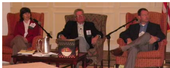
“Thinking Outside the Box” Panel