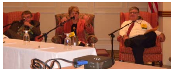
State Commissioner Panel